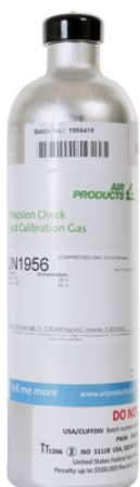
110L canister dimensions 358mm (h) x 90mm (d)

The above products are available as 58L canisters, minimum order quantities may apply.